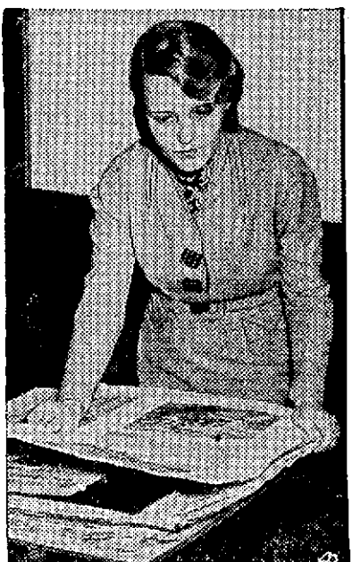
And Gave Wife A Job Clipping And Nursing